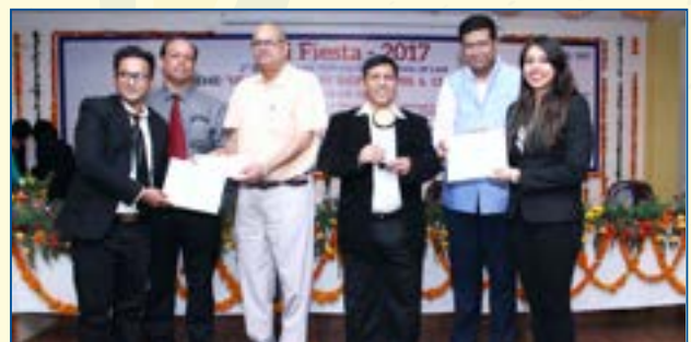
Moot Court Winners being awarded in Felicitation