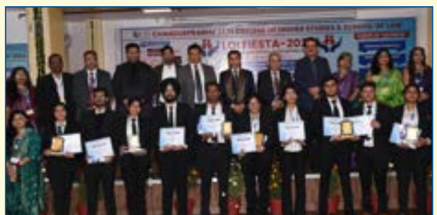
Winners of all the Competitions with the Esteemed Guests at the Valedictory Ceremony