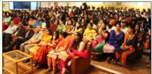
Glimpse of Audience @ LOI FIESTA 2017