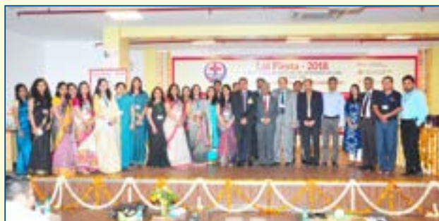
Guests & SoL Team at Valedictory Session of National Conference