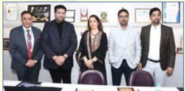
With the Judges of National Client Counseling & National Debate Competitions