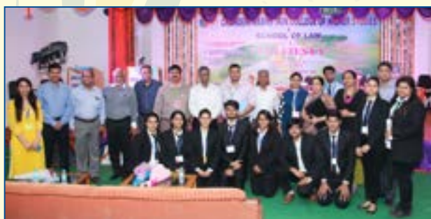
Organizers with Guests