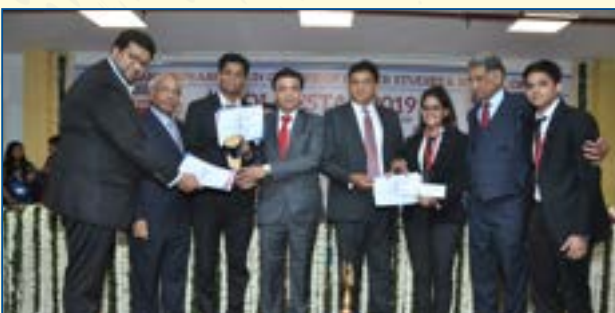
Moot Court Winners being Awarded by Guests in the Valedictory Ceremony