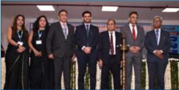
Lamp Lighting in the Inaugural Ceremony

Theme: "Social & Welfare Laws: Emerging Challenges & Solutions" (March 01-02, 2024)