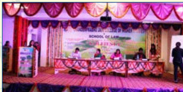
National Seminar in Progress