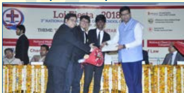
Moot Court Winners being Awarded in Felicitation