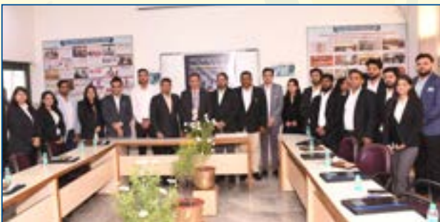
Felicitation of Judges of National Moot Court Competition