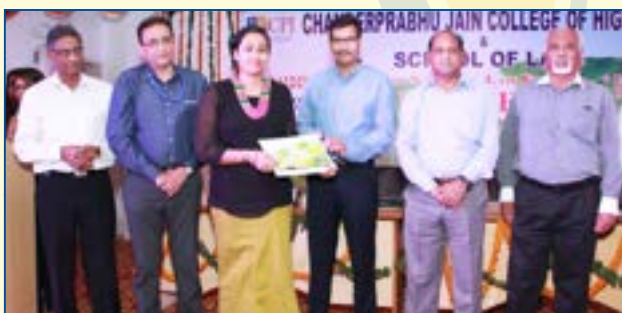
Felicitation of Participants