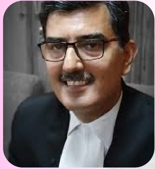
HON'BLE SHRI JUSTICE SHEEL NAGU CHANCELLOR DHARMASHASTRA NATIONAL LAW UNIVERSITY, JABALPUR (M.P.)